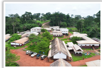
Bongolo Hospital Campus

For up-to-date stories and information, please see Bongolo Hospital's website or Facebook page .