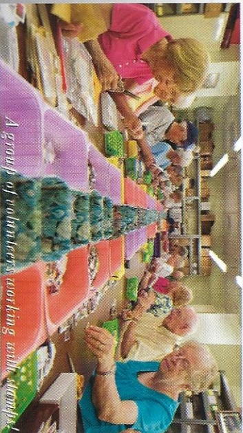
A group of volunteers working with stamps!

Volunteers, mostly residents of Shell Point Retirement Community, in Fort Myers, Florida trim and sort the stamps into categories. United States stamps are divided into these categories: common, commemorative, love, Christmas, nonprofit, high value, airmail, off paper and all computer generated stamps. Canadian and all foreign stamps are also welcomed. These categorized stamps are sold in varying amounts. The common stamps are sold in 25 pound boxes to wholesalers. We greatly appreciate collections and albums of stamps.